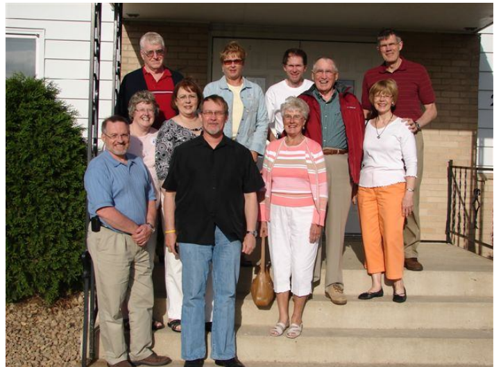
Elvingsvingen Members at the Hanska Stabbur and Zion Lutheran Church