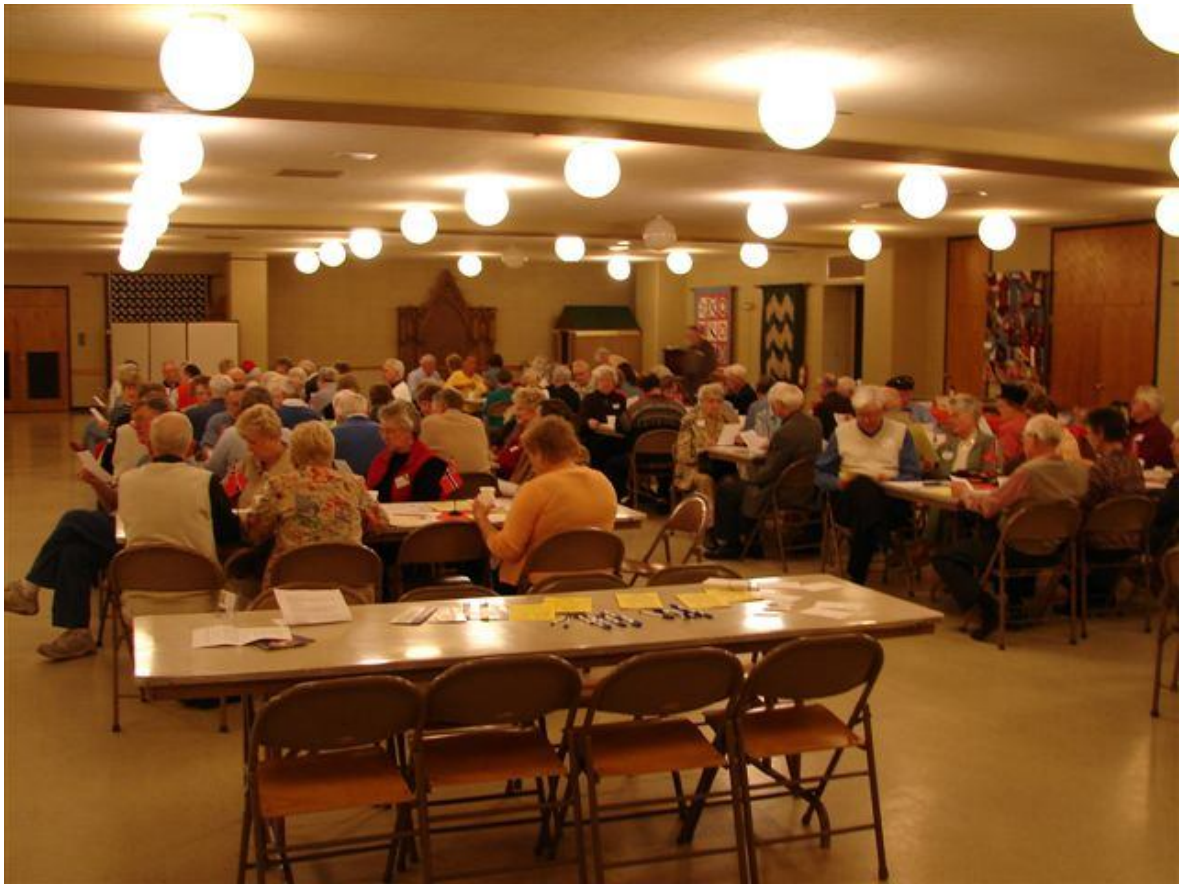
May 2008 Sons of Norway Meeting at Bethlehem Lutheran Church